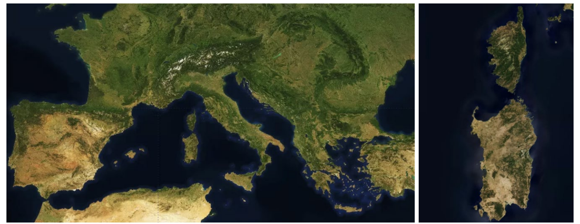
Figure 1: The Mediterranean Basin with a satellite view of Sardinia, Corsica, and their surrounding islands.

The two islands are not separate entities but comprise one geographical system. Taking as a reference point the appeal for the application of an archipelagic approach to the study of insularity (Stratford et al, 2011), our aim is to highlight the importance of a relational perspective focused on what Pugh (2013) calls 'island movements' rather than an isolationist or an island-continent approach (for a detailed resumé on archipelagic studies and relationality, see Pugh, 2018). This perspective was developed first by scholars working on islands and archipelagos in the Caribbean and Pacific Ocean (DeLoughrey, 2001, 2007; Hau'ofa, 1993, 2008; Pugh, 2013), with a focus on theoretical aspects or comparative literature, and recently was adopted to explore other contexts, such as the case of Sicily and the Maltese Archipelago (Camonita, 2019). These works are more concerned with conceptualizing the archipelagic perspective than with exploring the physical relations between the islands (trade, migration, transport) or island-to-island cooperation, which are the elements that make up an archipelago (relevant exceptions are Anim-Addo, 2013; Camonita, 2019; Xie et al, 2020).